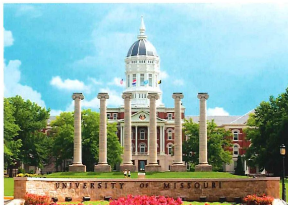
University of Missouri-Columbia